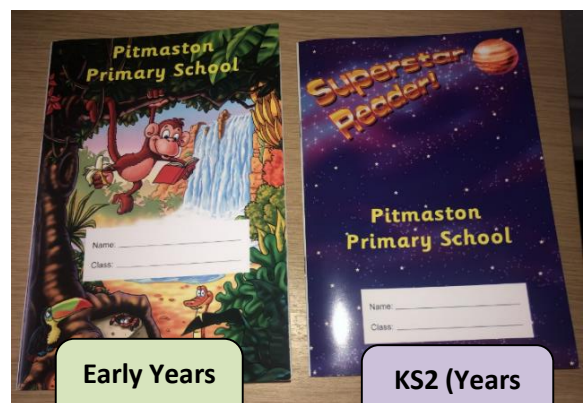
Early Years & KS1