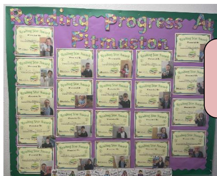
Whole school reading displays