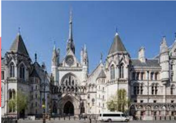
Royal Courts of London